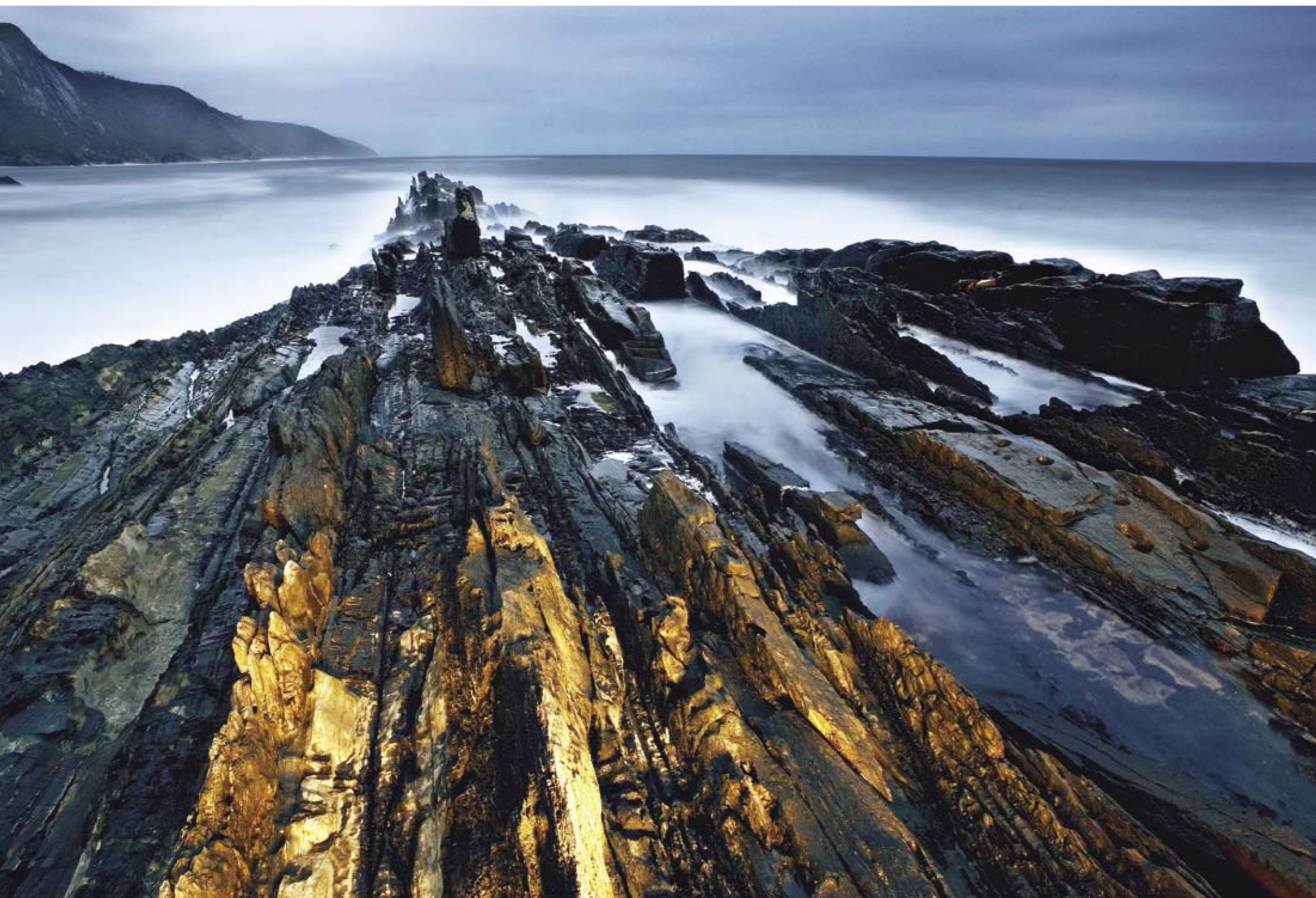
Beach, Nature's Valley.