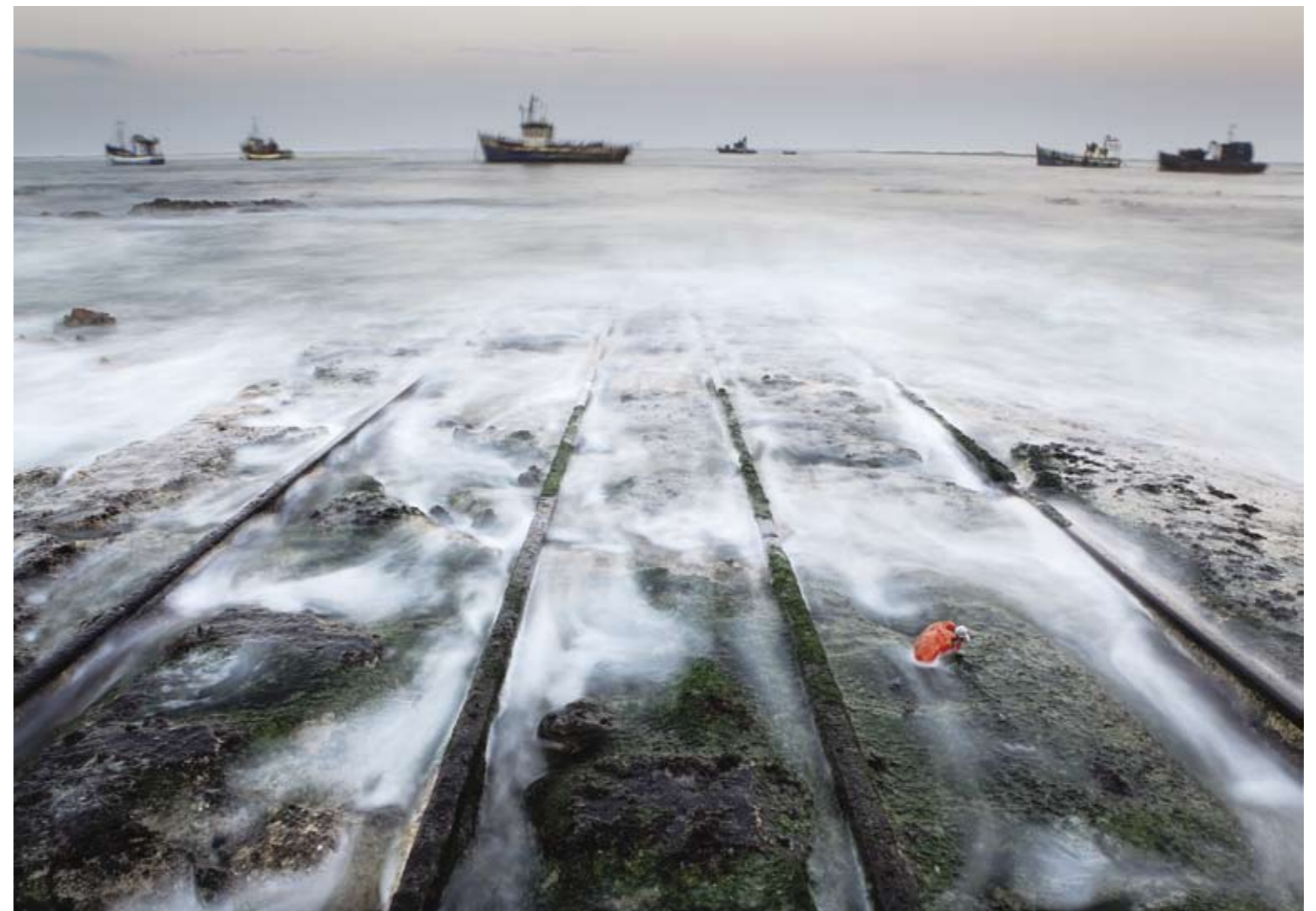
Old slipway, Port Nolloth.