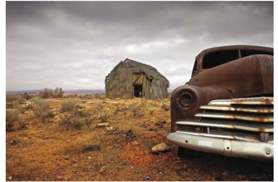
1948 Chevrolet Fleetline, near Calvinia.