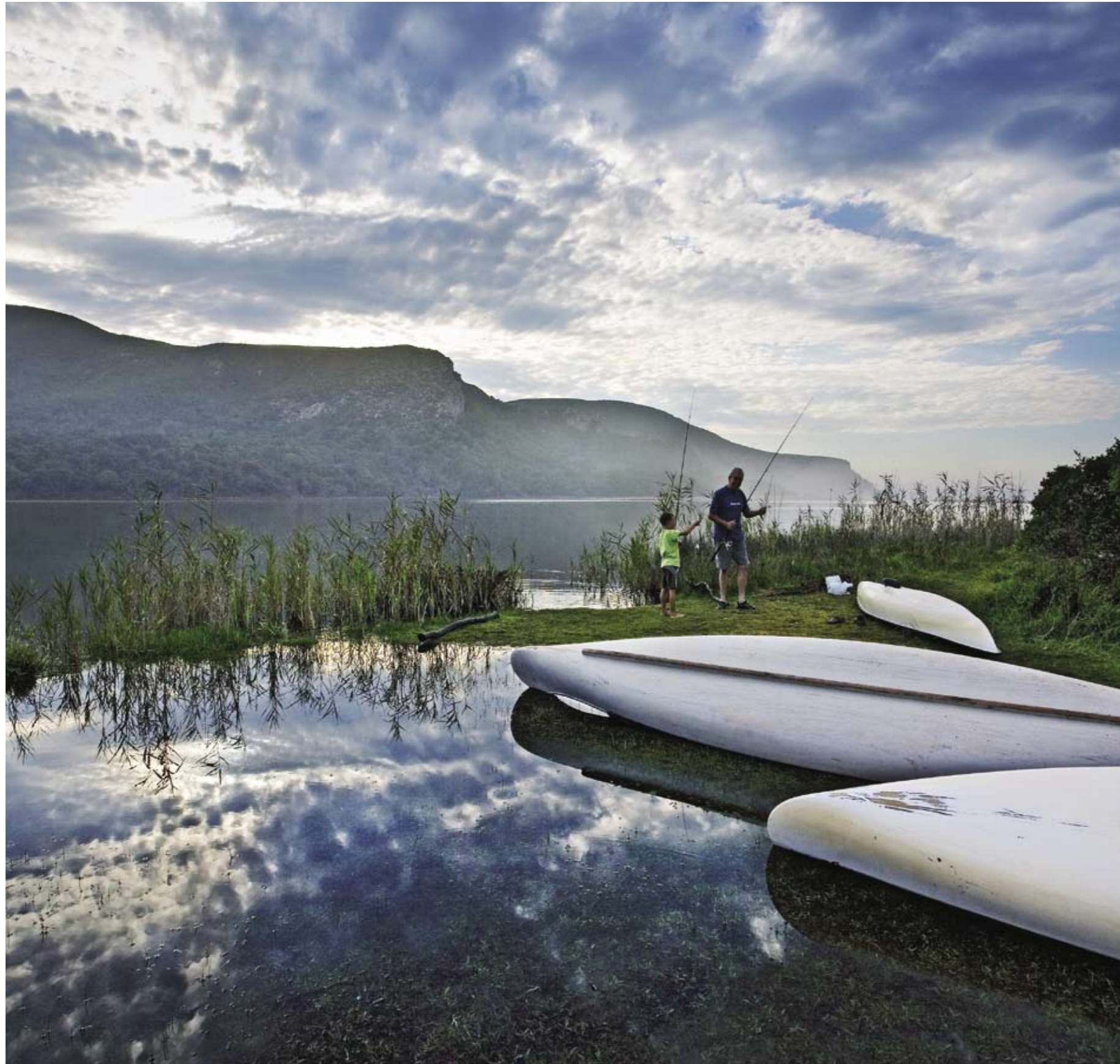
Fishing at Nature's Valley.