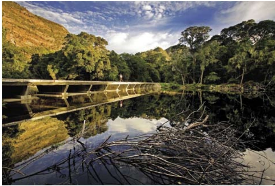
Bridge over the Grootrivier, Nature's Valley.