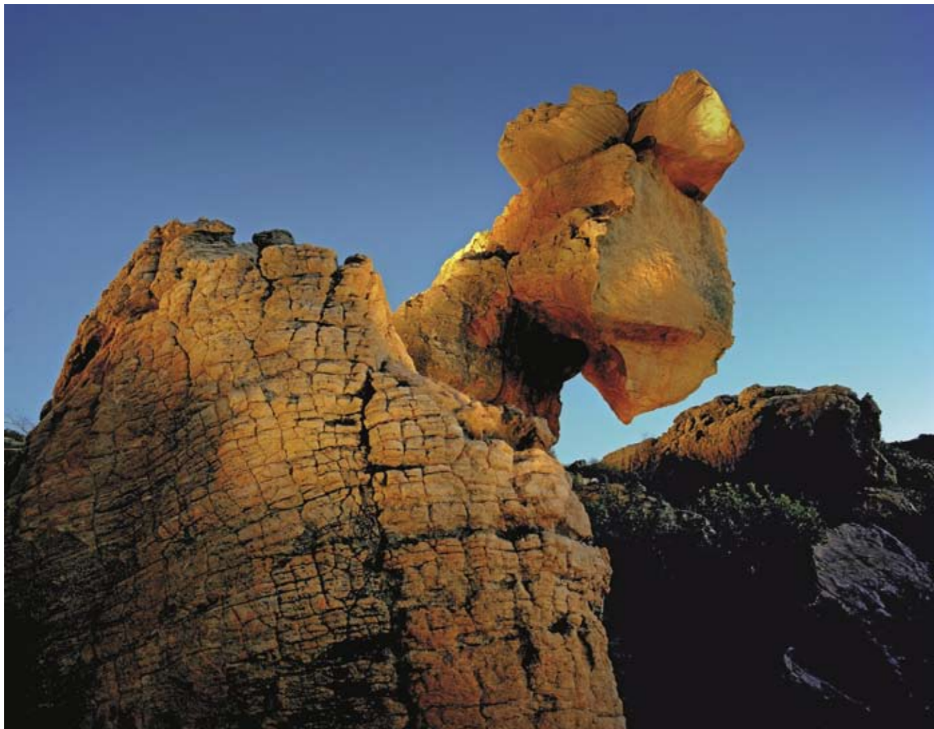
Rock shapes, Matsikamma Mountains, Vanrhynsdorp.