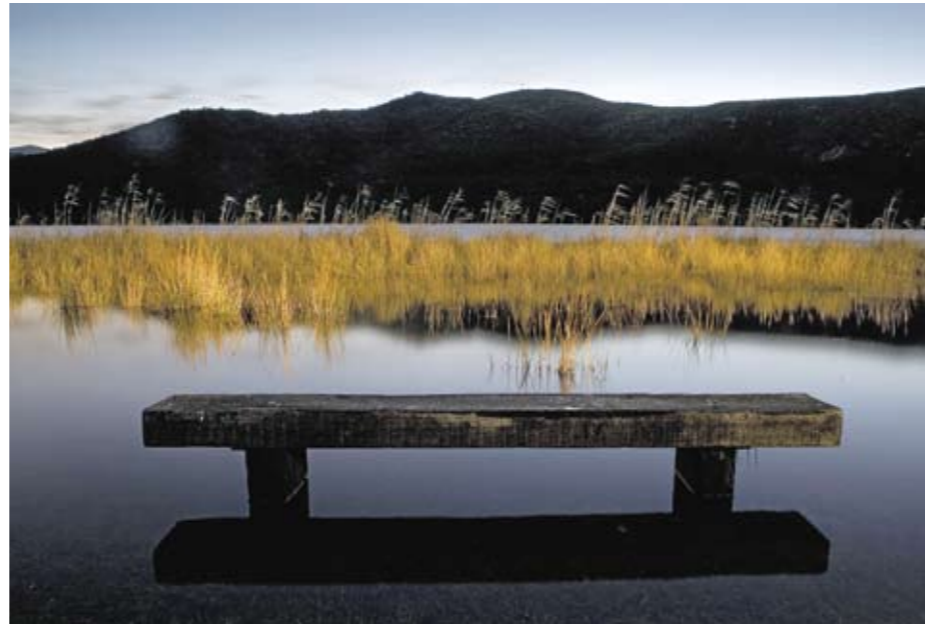
Tranquil setting, Nature's Valley.